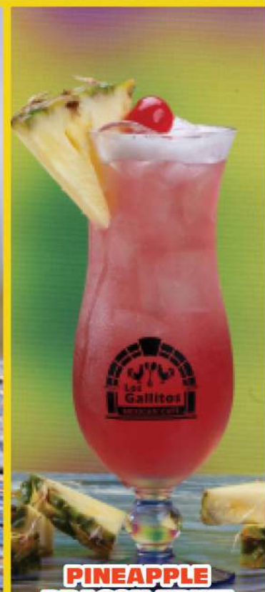
PINEAPPLE DRAGON FRUIT