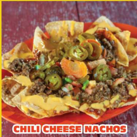
CHILI CHEESE NACHOS

QUESADILLA Your choice of chicken or beef. Served with guacamole and jalapeños.