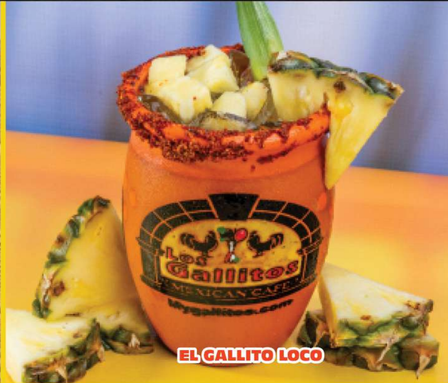
EL GALLITO LOCO

EL GALLITO LOCO (Top seller) served with Jimador tequila, pineapple juice, fresh squeezed lime juice, fresh fruit and topped with Squirt. $ 14.99