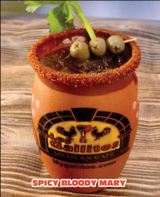
SPICY BLOODY MARY

SPICY BLOODY MARY The best spicy bloody Mary with the perfect combination of tomato juice and Tito's vodka, it's a cool and refreshing drink . $15.99