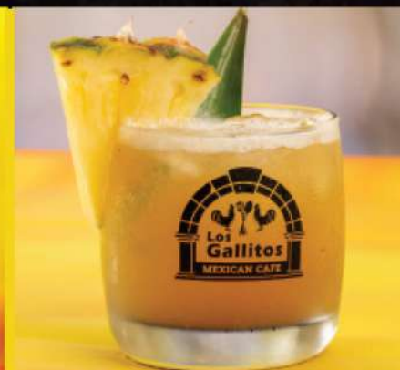
CROWN APPLE SMASH