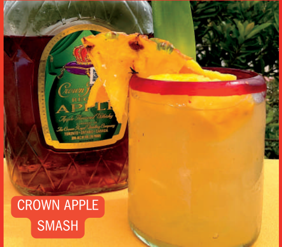
CROWN APPLE SMASH

CROWN APPLE WHISKEY SHAKEN WITH PINEAPPLE, ORGANIC AGAVE & FRESH SQUEEZED LEMON JUICE. SERVED ON THE ROCKS.