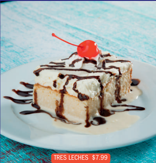
TRES LECHES $7.99