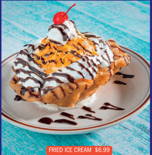
FRIED ICE CREAM $6.99