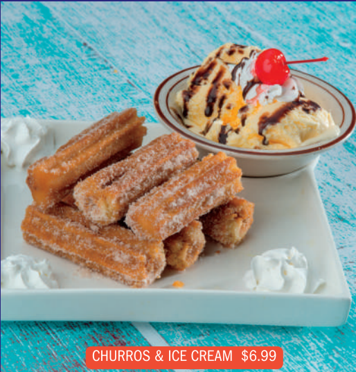
CHURROS & ICE CREAM $6.99