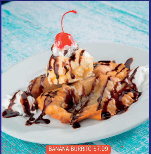
BANANA BURRITO $7.99