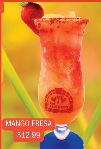
MANGO FRESA $12.99

TRADITIONAL REFRESHING COCKTAIL MADE WITH ARUGULA, TEQUILA WITH FRESH SQUEEZE LIME JUICE AND SQUIRT. SERVED ON THE ROCKS WITH CHAMOY & TAJIN RIM.