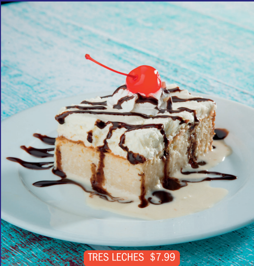
TRES LECHES $7.99