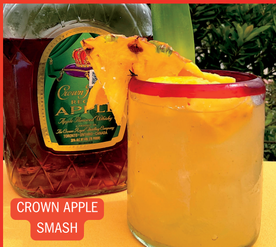
CROWN APPLE SMASH