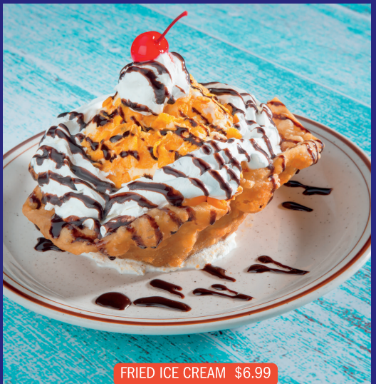
FRIED ICE CREAM $6.99