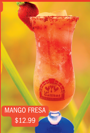
MANGO FRESA $12.99

TRADITIONAL REFRESHING COCKTAIL MADE WITH ARUGULA, TEQUILA WITH FRESH SQUEEZE LIME JUICE AND SQUIRT. SERVED ON THE ROCKS WITH CHAMOY & TAJIN RIM.