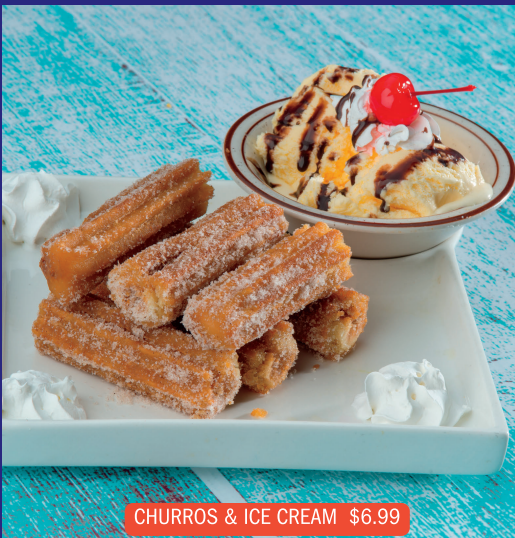
CHURROS & ICE CREAM $6.99